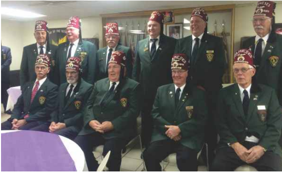
This is our newly elected executive for the "Algonquin Shrine Club" for 2016. They will take their respective offices at the same time as the newly elected Divan will.