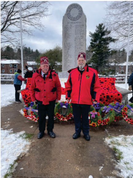
Remembrance Day 2025